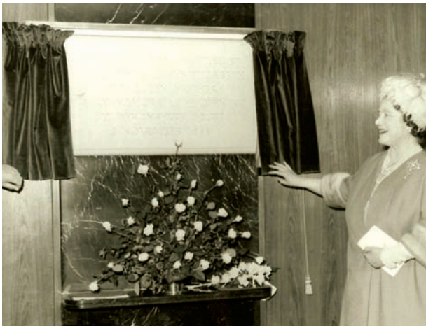
The Queen Mother declares Devonshire Court open 2 November 1966