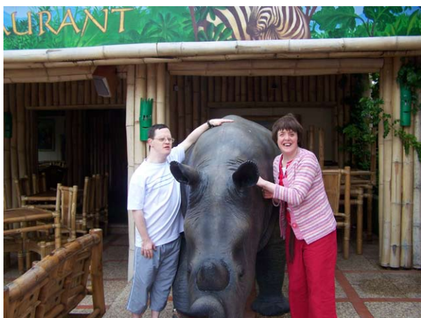
Two Harry Priestley House residents enjoy time away on holiday

The holiday was thoroughly enjoyed by those who went, particularly the flight, as some of the residents had never flown before. The group stayed in a private villa, enjoyed the swimming pool and also made regular visits down to the sandy beach as well as to the abundance of restaurants and bars that are on the island!