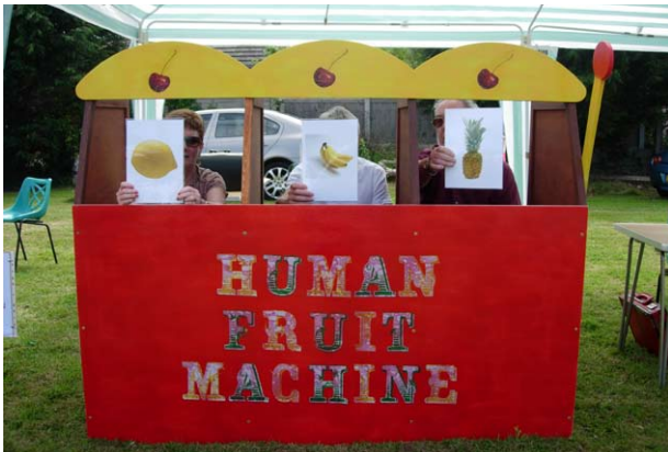
Queen Elizabeth Court's Human Fruit Machine!

There were some very interesting stalls selling plants, books, bric-a-brac, cakes, local cheeses and paintings. Everyone also thoroughly enjoyed the games, raffles, face-painting, treasure hunts, coconut shire, sponge throwing and even a human fruit machine!