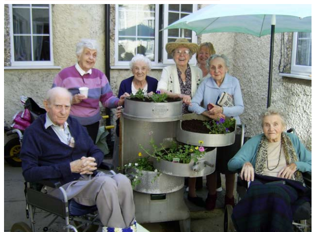
Residents from The Tithebarn after their planting