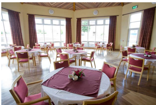
The new dining room at Scarborough Court

Scarborough Court will continue to provide the same high level of care as the old Home, which was given three-star rating for excellence in care from the Commission for Social Care Inspection (CSCI).