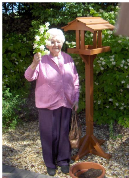
Making the most of the sunshine at Devonshire Court