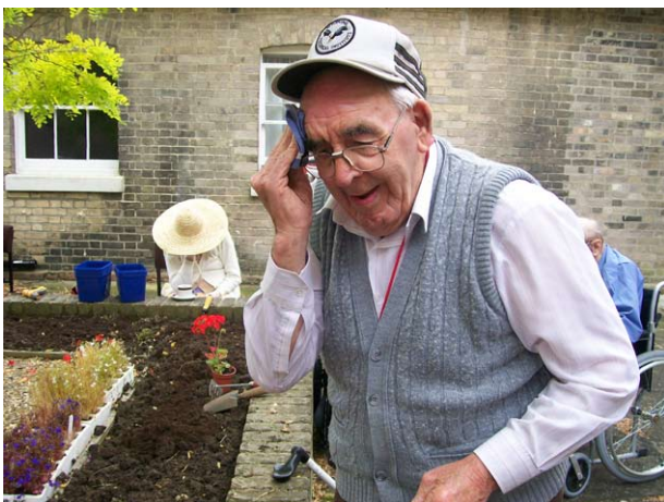
Phew, it's hot work at Prince Edward Duke of Kent Court!

Let's hope the sunshine continues as well as the gardening!