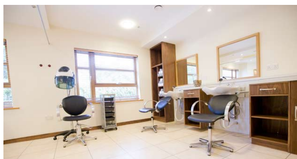
Reflections, hair salon and pamper room