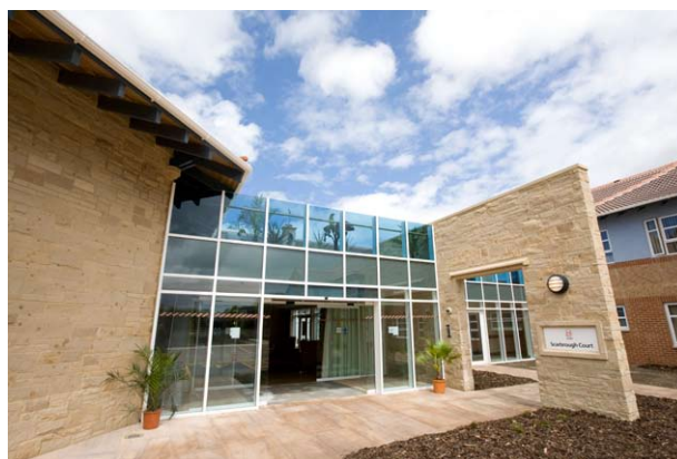
The new Scarborough Court

Over 150 people attended each open day and £1,600 was donated by local masons to the new Home. Residents and their relatives also had the chance to look around the Home and they have now moved and settled in to their new home.