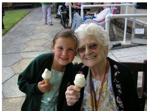
A visitor from the local primary school enjoys her ice cream with a resident

“The residents who were unable to go out to the van were taken ice creams and nearly everyone in the home had an ice cream, which really were the genuine “99s” complete with chocolate flake. The daughter of one of the residents on the nursing wing said that she had not seen her mother smile so much in years, and could we please have the ice cream van back soon!