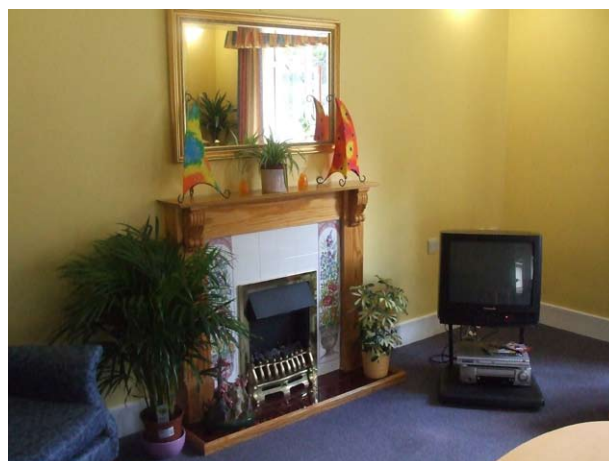
Shannon Court's newly refurbished Dementia Support Unit's living room

"For instance, we chose red toilet seats and special dementia specific signage as many residents fall due to not being able to distinguish the toilet seat from the wall. Therefore we aim to minimise disorientation and falls by this means.