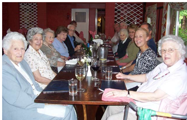
Cornwallis Court residents enjoy their pub meal