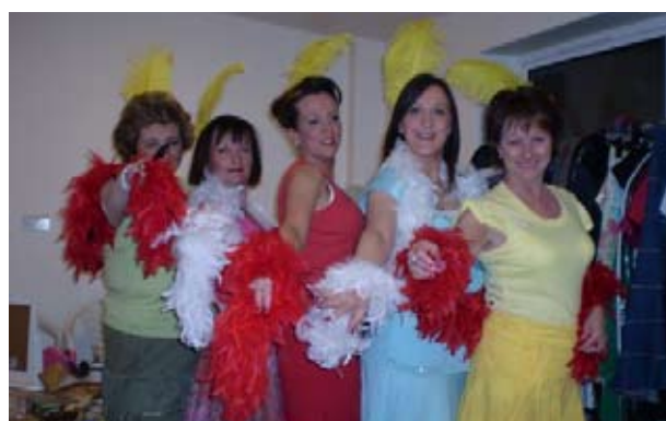
The Princesses perform Copacabana