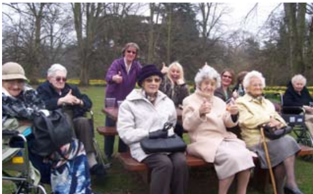
Thumbs up for a day at Nowton Park!

Cornwallis Court, Bury St. Edmunds, residents enjoyed a day out at Nowton Park recently. They had a lovely afternoon of fresh air and daffodils.