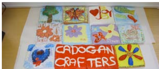
The tiles made by the "Cadogan Crafters"

Cadogan Court residents, the "Cadogan Crafters", have been very busy recently. They made fantastic clay tiles which were fired and painted with acrylic paint. The tiles will be on display in the Home shortly.