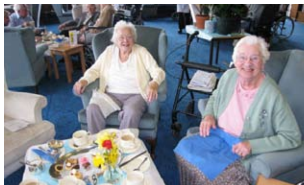
Residents enjoy high tea at the Devonshire Ritz

A wonderful pianist played in the background and everyone had a fantastic time. There is only one small problem - everyone now wants tea at the Ritz for every supper!