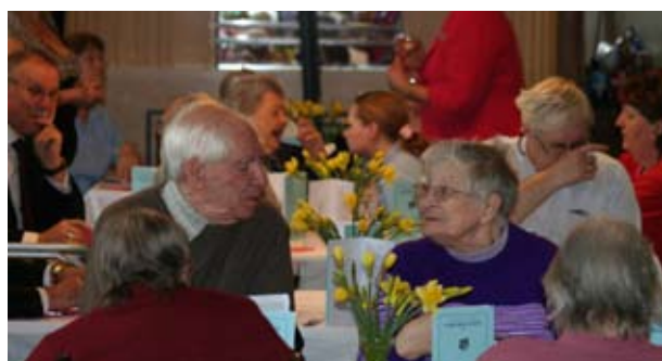
Barford Court residents enjoy their Sunday Lunch

Also at Barford Court, residents were recently treated to a lovely five-course Sunday Lunch by the Association of Friends. The residents enjoyed it very much.