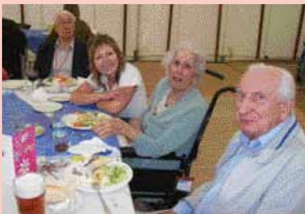
Residents from Prince Edward Duke of Kent Court enjoy the luncheon.

Everyone had a lovely week and enjoyed 'A Breath of Fresh Air'.