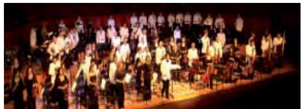
The Royal Philharmonic Orchestra entertain the Berkshire Province.

To all that attended, a hearty thank you.