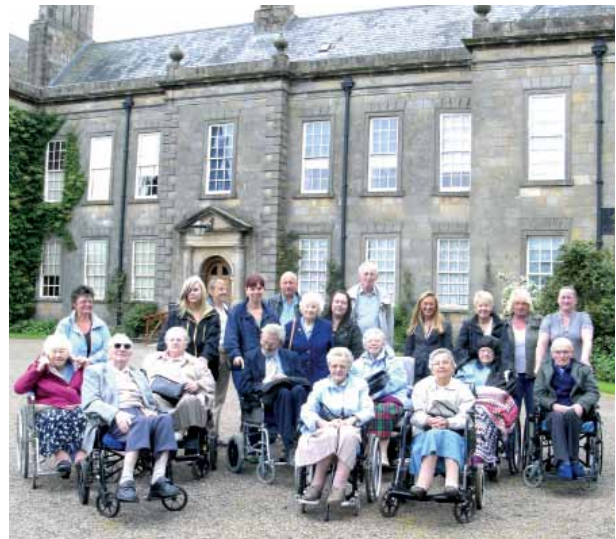
Scarborough Court residents at Wallington Hall.

Scarborough Court also celebrated American Independence Day with popcorn and doughnuts followed by a quiz.