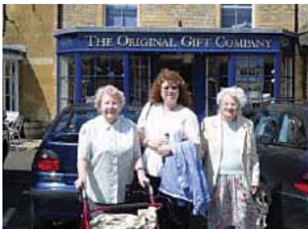
Residents enjoying themselves in the Cotswolds.

In July, several residents from Albert Edward Prince of Wales Court, Mid Glamorgan, were invited by The Bridgend Good Neighbours, (retired and widowed Masons), to join them on a trip to the Cotswolds where they had lunch in the Wold and visited Bourton-on-the-Water.