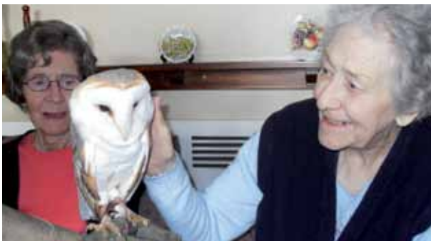
Resident at Queen Elizabeth Court get up close and personal with an owl.