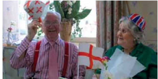
Residents enjoy the St George's Day celebrations.

Residents at James Terry Court, Croydon celebrated St George's Day in style with entertainment provided by SG Productions, food and drink. The day was a great success and enjoyed by the residents.