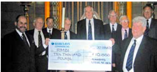
Flambard Lodge present their cheque.

If any other Lodges and Chapters in Festival for the RMBI are finding innovative ways of raising money, then please let us know and we will help to promote your ideas in whatever way we can.