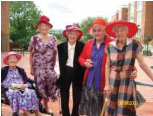
Wearing purple and red at the Purple & Red Poetry Day.

Devonshire Court, Leicester, entered the 'Breath of Fresh Air' competition organised by NAPA.