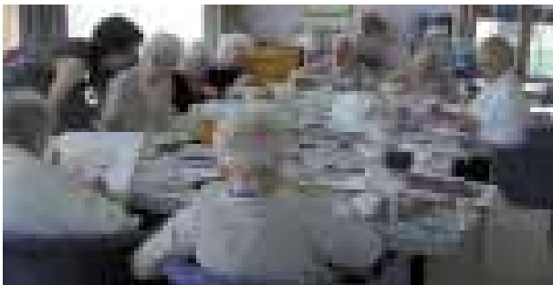
Residents work hard on their silk paintings.

Prince George Duke of Kent Court, Kent, are extremely fortunate in having established a connection with Dulwich Picture Gallery. The Gallery was the first public picture gallery ever opened in the UK and organises private viewings and workshops.