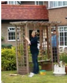
British Gas Engineers paint the garden bench.

A lot of work and effort goes into maintaining the wonderful facility which gives so much pleasure to the residents, staff and visitors. Recently the Home received help from a team of 26 British Gas Engineers. Armed with paint sprays, paint brushes and trimmers they spent a full day painting the boundary fences, garden furniture, dovecote and cutting back undergrowth. The spruce up has made a walk in the gardens more pleasurable.