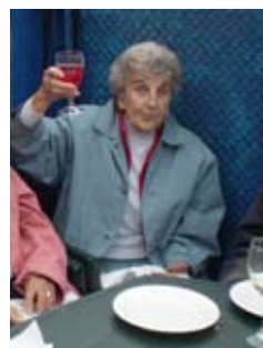
Top left: Residents from Prince George Duke of Kent Court. Top right: Residents from Ecclesholme. Bottom left: Resident from The Tithebarn, all enjoyed their trips out on the boats.