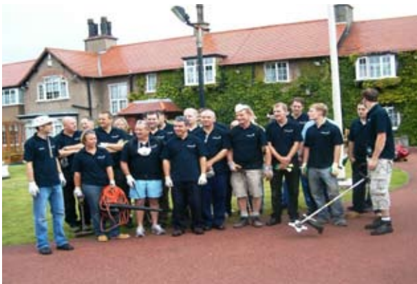
The British Gas Engineers ready and armed to help The Tithebarn.

There are also some magnificent grounds at the Home with an abundance of flowers and trees.