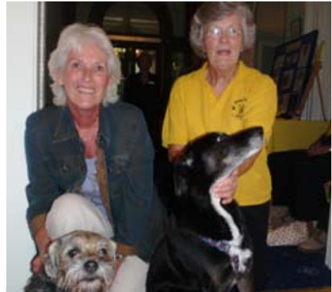
Representatives from Waggy Tails Dog Rescue at the garden party at Zetland Court.

With this in mind, the Home held an animal charity event where the local Cat Protection League and Waggy Tails Dog Rescue were invited to the