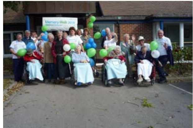
Residents, relatives, friends and staff outside the Home at the start of their walk.

In all parts of the country people were taking part in Memory Walks on 15th September 2009 to remember people with dementia. Connaught Court, York, organised its own walk where residents, relatives, friends and staff from the Home carried out a sponsored walk and wheelchair push for the Alzheimer's Society Memory Walk. The participants started at the Home and made their way to Rowntree Park and back to the Home covering about two miles with residents. A lovely day was had by all and they raised over £400 for the charity.