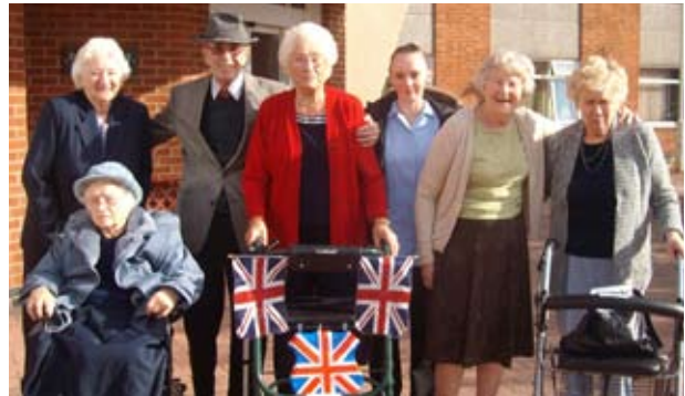
Residents at Devonshire Court carry out a sponsored walk.

Residents at Devonshire Court, Leicestershire carried out a sponsored walk for 'Young at Heart Day'. They had great fun collecting sponsors from the staff, friends & family and raised £76 for their Amenity Fund. They walked around the Home three times and were sponsored per lap. Everyone who took part was thoroughly proud of themselves.