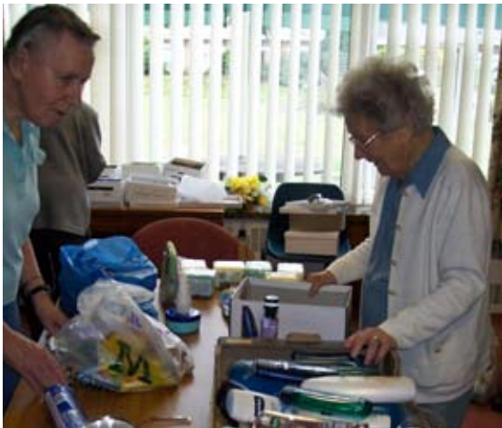
Residents help to pack the harvest festival boxes for the troops.

Prince George Duke of Kent Court, Kent, recently held its annual Harvest Festival, Songs of Praise. Residents spent a busy morning packing boxes so that the harvest goods could be sent to the troops in Afghanistan. Much to everyone's satisfaction, at least 40 boxes will be sent out to the troops.