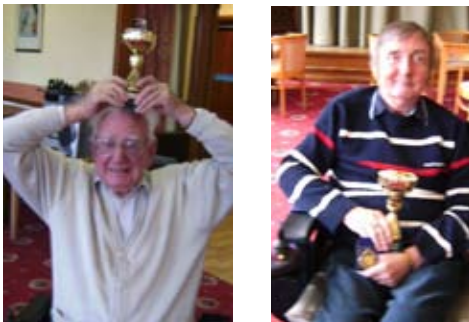
Proud Lord Harris Court residents show off their achievements in winning the Ageless Golf Cup.

Ageless Golf is a game for all abilities where participants can either hit or throw a ball to try to hit the targets.