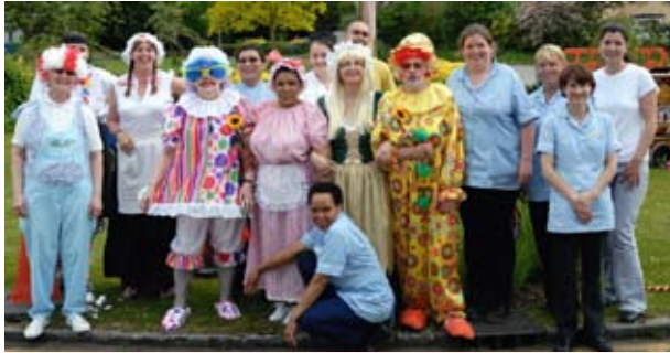
Staff at Lord Harris Court down around on their Founders' Fun Day

Lord Harris Court in Berkshire celebrated Founders' Day with a Fun Day for the residents. Staff donned their outfits and took the residents out to enjoy various games. The finale was a wheelchair assault course, greatly enjoyed by residents, especially when the Managers were in the wheelchairs! The weather was perfect and a good day was had by all.