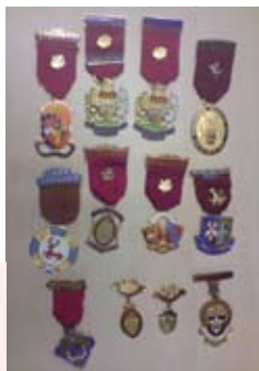
Pictured right: Already donated RMBI Festival Jewels for the collection.